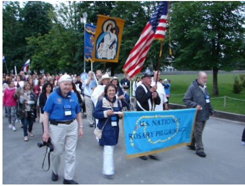
Torchlight Procession 2013

This is our 40 th year, that the Knights of Columbus, Our Lady of Lourdes, Council 5890 from Washingtonville, NY is raising funds to send handicapped children and a parent or guardian to the Marion shrine in Lourdes, France. This year the nine young ambassadors, selected from the archdiocese of New York, will depart in June for the ten day pilgrimage as part of the 60 th US National Rosary pilgrimage. All of these young ambassadors are special in the fact that they each possess a physical or mental handicap.